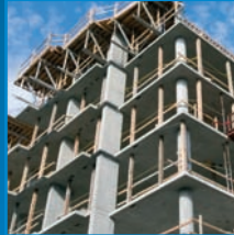
Commercial & Industrial