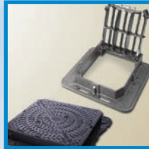
Access Covers & Gratings