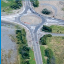
Roads & Highways