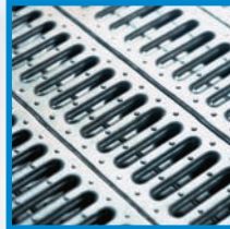
Surface Water Drainage