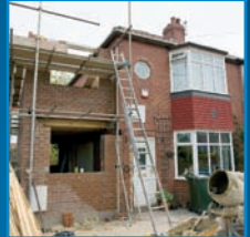
Repairs & Maintenance