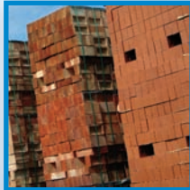
Bricks & Blocks